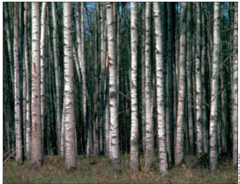
Hardwood forest composed primarily of trembling aspen in the boreal forest of northern Canada. Forests may not be particularly resistant to certain disturbances to which they are resilient

At a genetic level, the capacity for resilience comes from the ability of a species to persist over a range of environmental variability, such as by tolerating a range of temperatures or a certain level of drought. At the species level, there are various behavioural and functional responses that can assist a species to repopulate a disturbed area or respond to environmental changes. Further, ecosystem assembly processes very much reflect the landscape pool of available species (e.g. Tylanakis et al. , 2008), as well as landscape connectivity. At the landscape scale, heterogeneity among forest patches can provide a measure of redundancy among species and a source for colonizers that, as a forest begins to redevelop or recover after disturbance, should enable communities to converge on the original forest types. Hence, the consideration of resilience necessarily involves thinking from small to large scales.