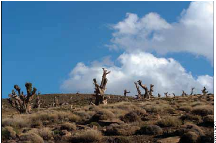
Degraded juniper ( Juniperus thurifera ) forest in the High Atlas, Morocco